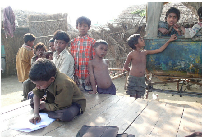
A young child reads among onlookers in India.