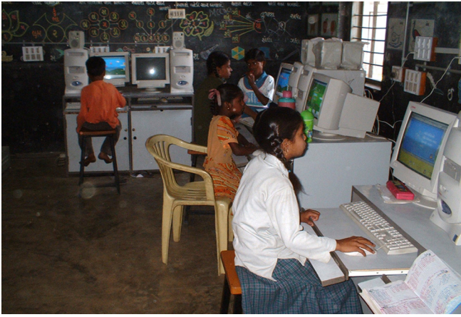
Students play educational computer game in Vadodara, India