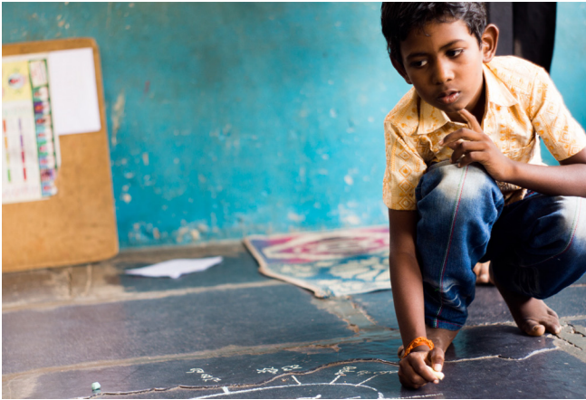
Student at work in classroom

While learning levels in Haryana, a state in northwest India, are higher than the national average, test scores in Kurukshetra and Mahendragarh, the two districts chosen for the evaluation, were quite low. Prior to the start of the evaluation, almost 84 percent of students in the study sample were unable to read a simple story, and more than 55 percent were unable to recognize two-digit numbers.