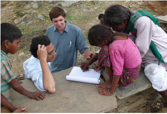
J-PAL staff help a young girl solve a maze exercise in India.