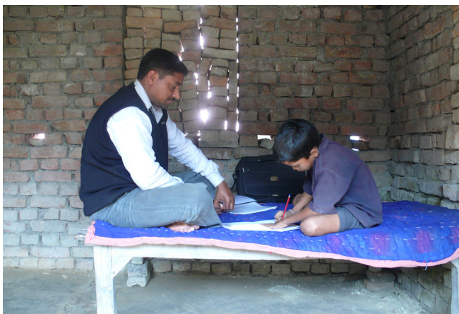
Father helping his son with his homework, India.