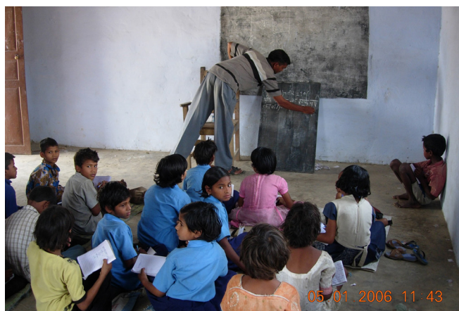
Indian children sitting on the floor of a classroom

Gurgaon, where this study takes place, is a small city just outside of Delhi that has experienced large growth over the past 10 years due to Delhi's urban sprawl. Though school enrollment rates in India are above 90 percent, in Gurgaon 47 percent of the children surveyed were not enrolled. Almost all of these children were from migrant families. Of the un-enrolled children, 96 percent of their parents said they were willing to send them to school, and only 1.4 percent of the children were working outside of their house.