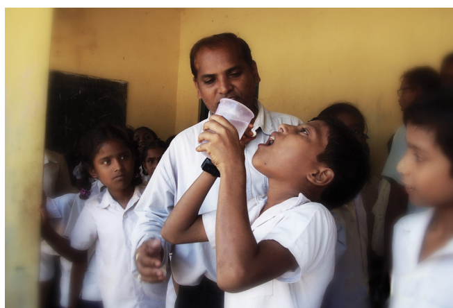
Teacher distributes medications to students in Delhi

Like other developing nations in the region, iron and Vitamin A deficiency affect many of India's children. Prior to the start of the study, over 69 percent of the sample of preschool aged children in urban Delhi was anemic and 30 percent suffered from intestinal worms, contributing to the high prevalence of malnutrition. Furthermore, 30 percent of the sample was underweight and 24 percent had stunted growth. Children in the study typically came from families of poor migrant laborers, and have a particularly high risk of anemia and other nutritional deficiencies.