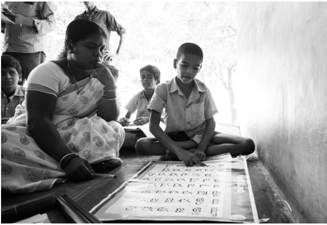
Training volunteers to hold after-school reading classes improved educational outcomes