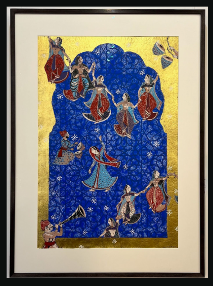
97 x 134cm. This work on paper is framed to museum standard with a hand stained and waxed ash frame, split baton hanging and sub-frame by Gloucester Room, Marylebone.

Natasha Kumar's Utsava is a celebration of life, family and belonging. It combines ancient Indian aesthetic and identity through actual, figurative representation and abstract sensibility.